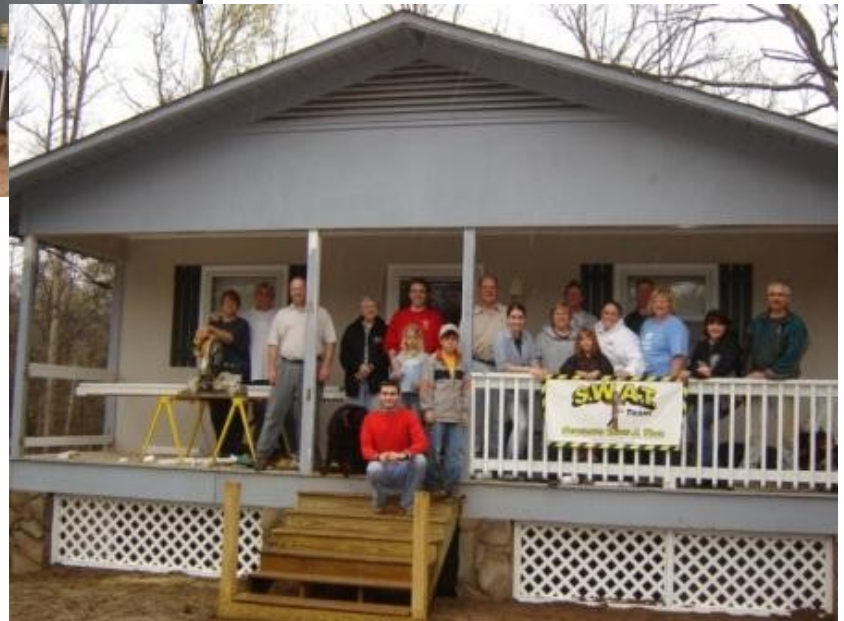
Right: Although the SWAT Team did not finish all the work to be done, their hard work really shows in the "after" picture