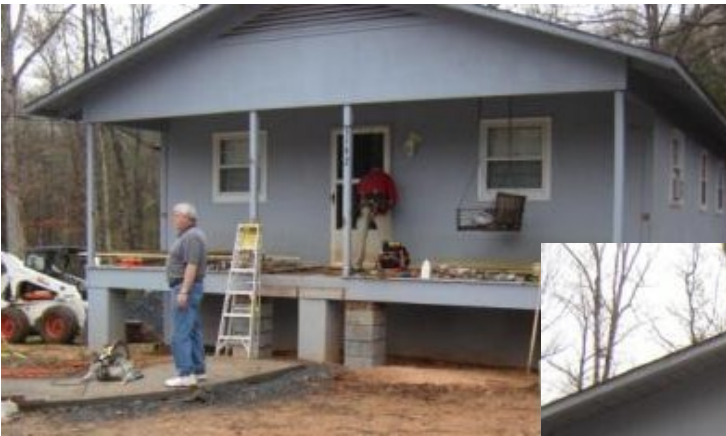
Above: The house at Victory Mountain as work began