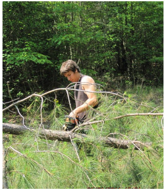
The author clears some fallen timber at Hickory Cove Bible Camp.

(For more photos from this event see page 4)